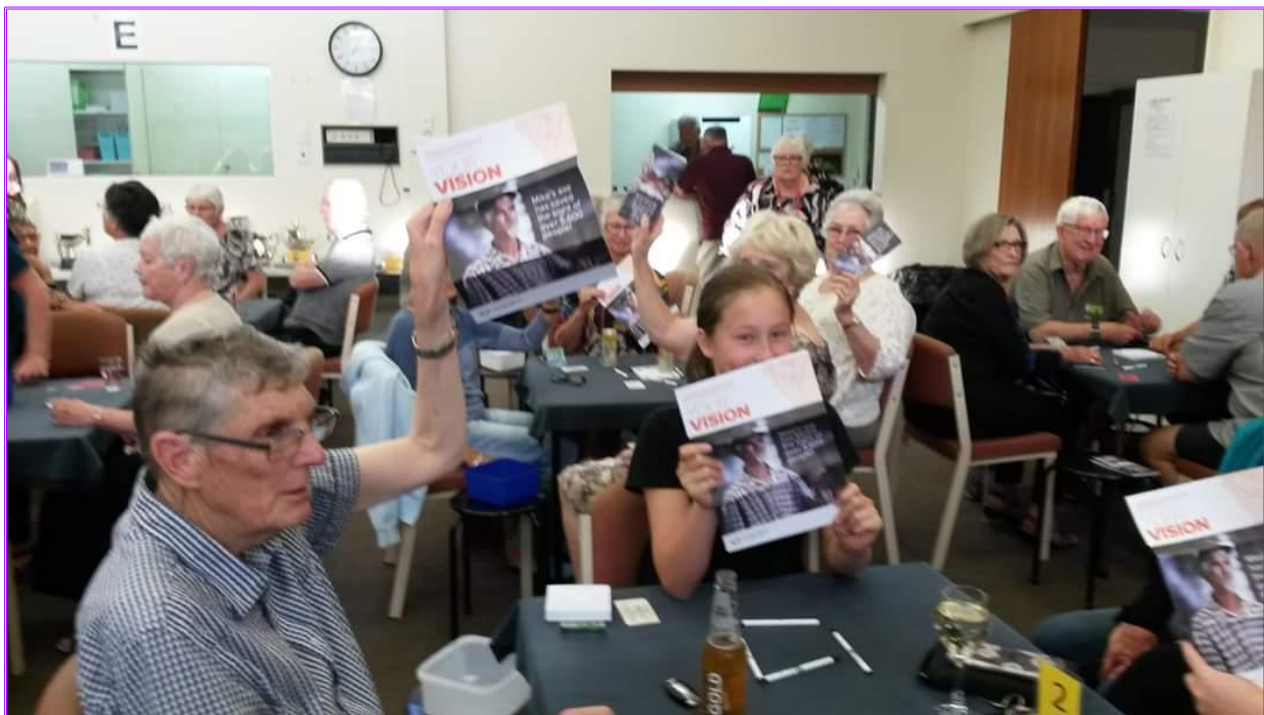
Members supporting the Fred Hollows Foundation in 2018