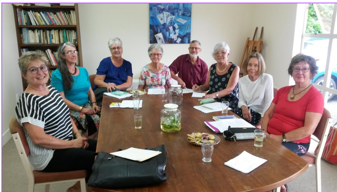
Some of our Directors 2018