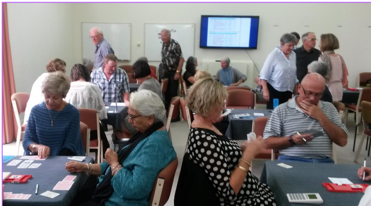
Intermediate Tournament 2019: The first session scores are displayed on the electronic screen on the rear wall

Helen Carryer assisted by Anne Fitzgibbons heads the volunteer dealing team. By 2020 over 70,000 hands had been dealt.