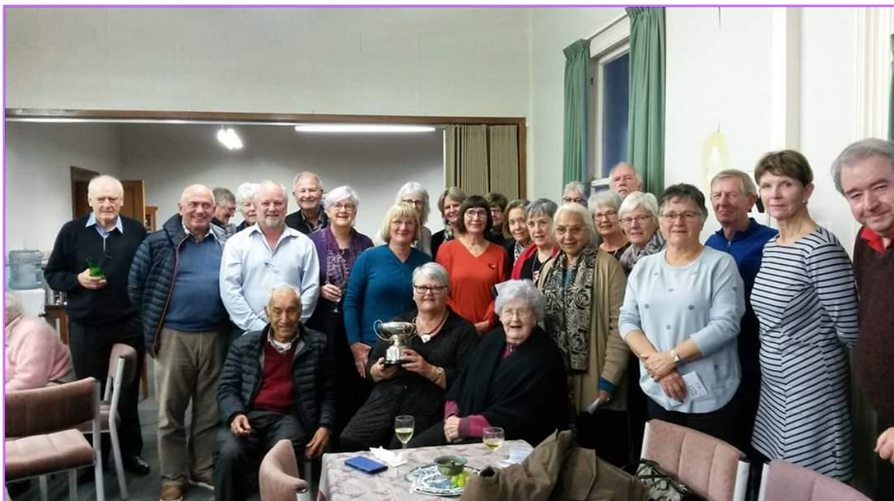
2019 Successful New Plymouth Rosebowl winners

Many was the time that a bus was hired to transport players. They were a lot of fun and very memorable trips!