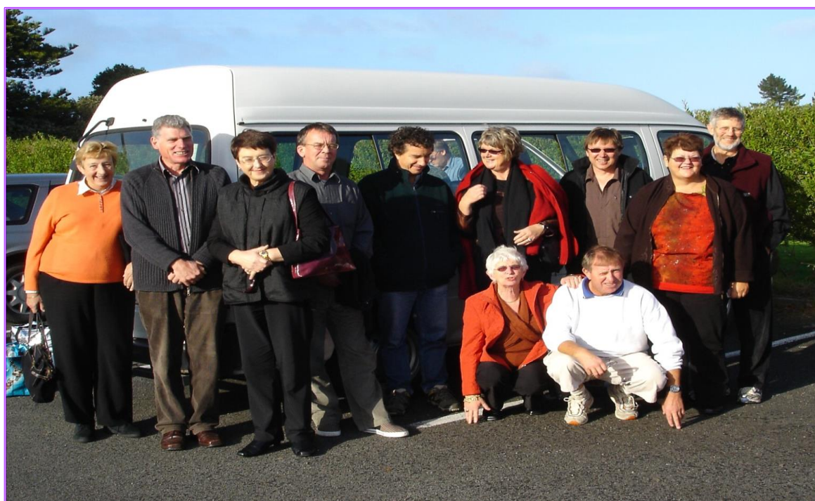
The New Plymouth team who contested the western CD club playoffs in Whanganui 2009

Our current tournaments are sponsored and this money goes towards prizes. Being conscious of outside players having to travel, we strive to keep entry fees low and aim to break even. Most players now enter tournaments electronically via the NZBA site and pay directly into the Club bank account, simplifying the Tournament Secretary position.